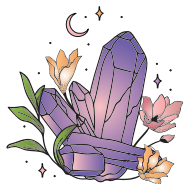
FEBRUARY amethyst WISDOM