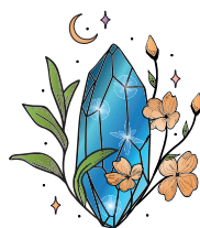
MARCH aquamarine SERENITY