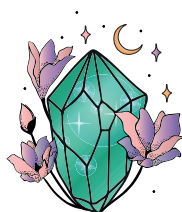
MAY emerald HOPE