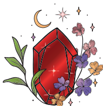
JANUARY garnet PROTECTION

A birthstone is a gemstone that represents a person's period of birth, such as the month they were born. Do you know your birthstone and its unique quality?