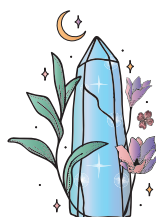
JUNE moonstone LOVE