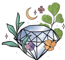
APRIL diamond STRENGTH